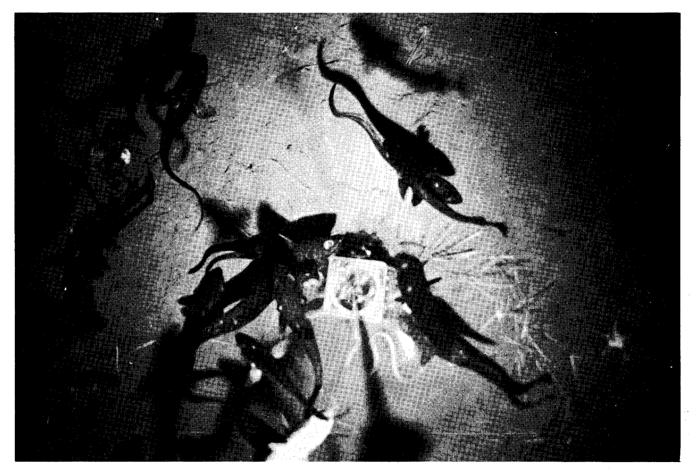
FIGURE 3. Grenadiers, hagfish, migrating tube worms and other creatures attracted to a bait and photographed by an untethered automatic camera at 1200 fathoms off Baja California.—(field view is about 9' x 12').

sources Laboratory in 1964, and in September of that year moved from the old, frame building on the Scripps campus, where it had been housed since 1954, to the newly built Fishery-Oceanography Center on a cliff site overlooking the ocean, \frac{1}{2} -mile north of the old location.